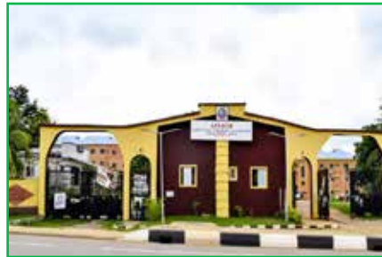
Lagos State University of Education, Michael Otedola Campus