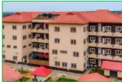
Epe General Hospital