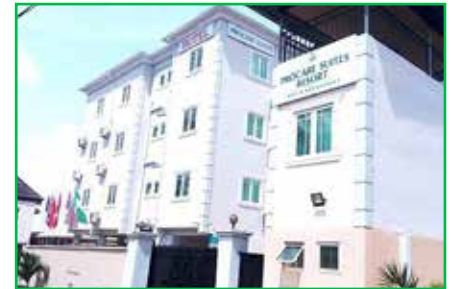
Procure Suites & Resorts Ltd