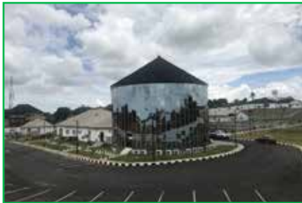
Jubilee Chalets Epe