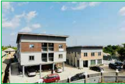
La Casa Hotel