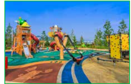
Joyrich Fun Park