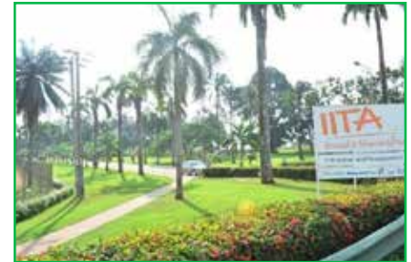
The international institute of Tropical Agriculture (IITA)