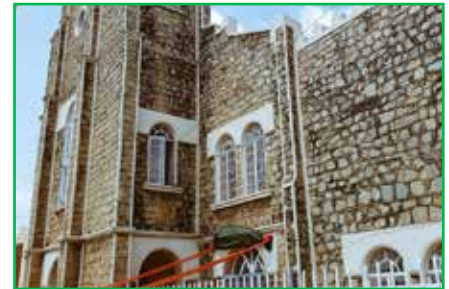
The First Baptist Church, Ibadan