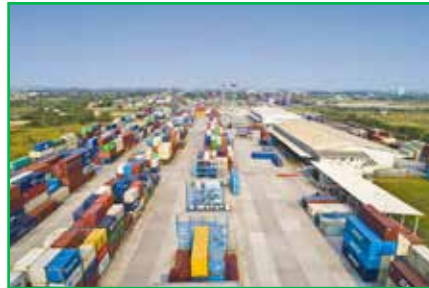
Ibadan Inland Dry Port