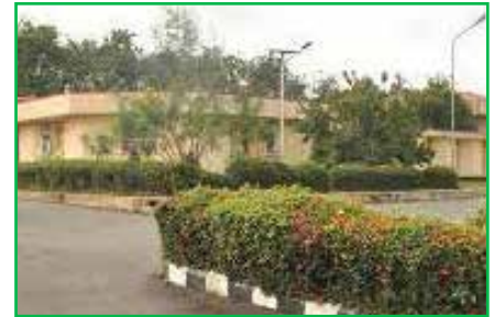
National Museum Of Unity