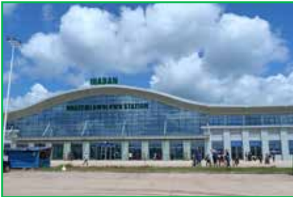
Moniya Ibadan Train Station