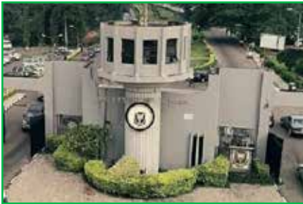
University of Ibadan